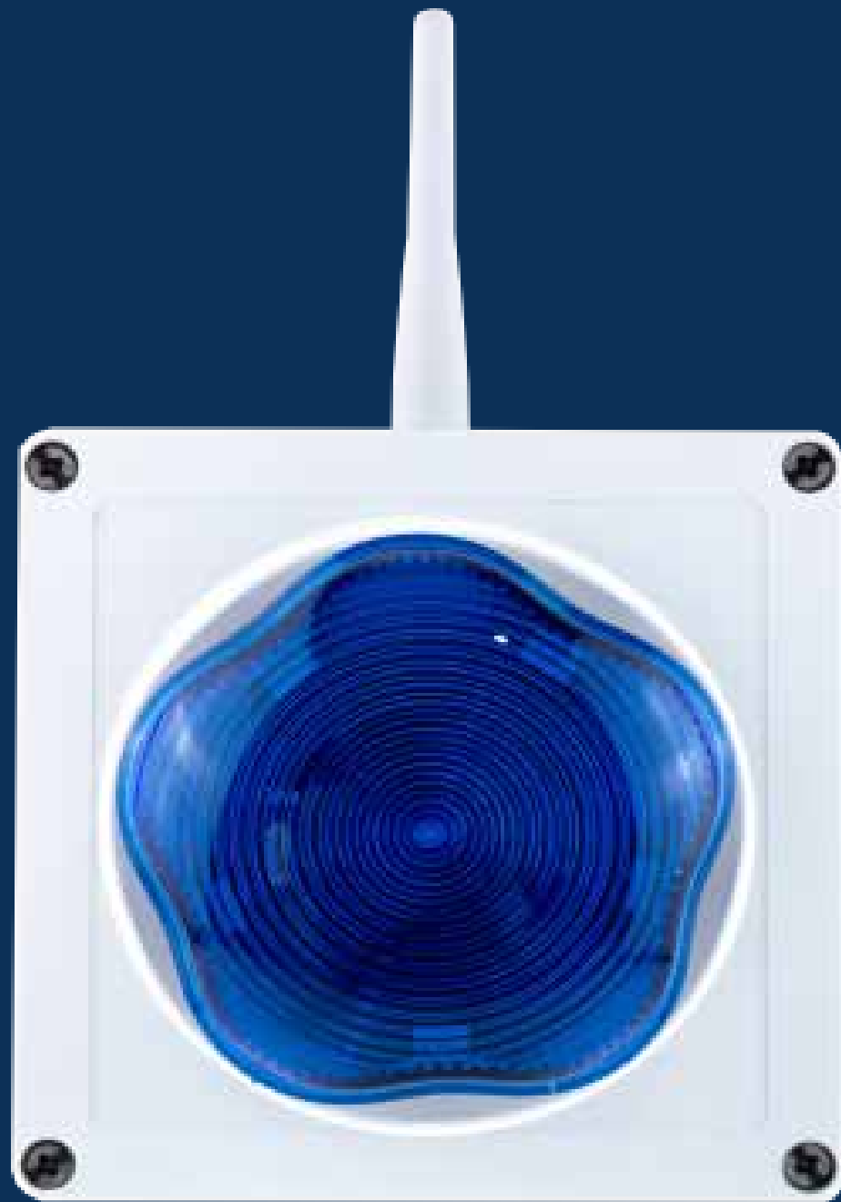
Internal/External Sounder Beacon