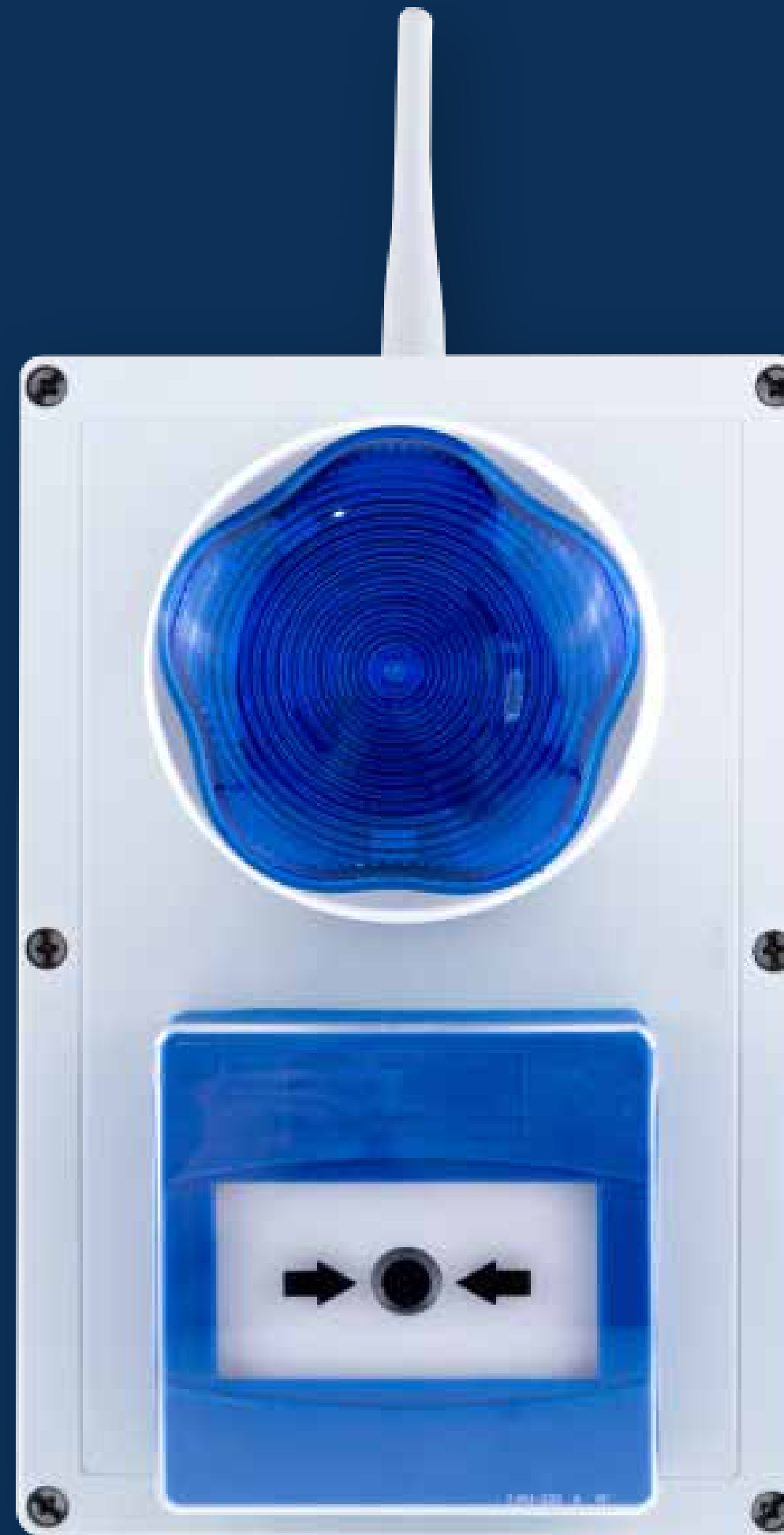
Master/Slave Call-point Sounder Beacon